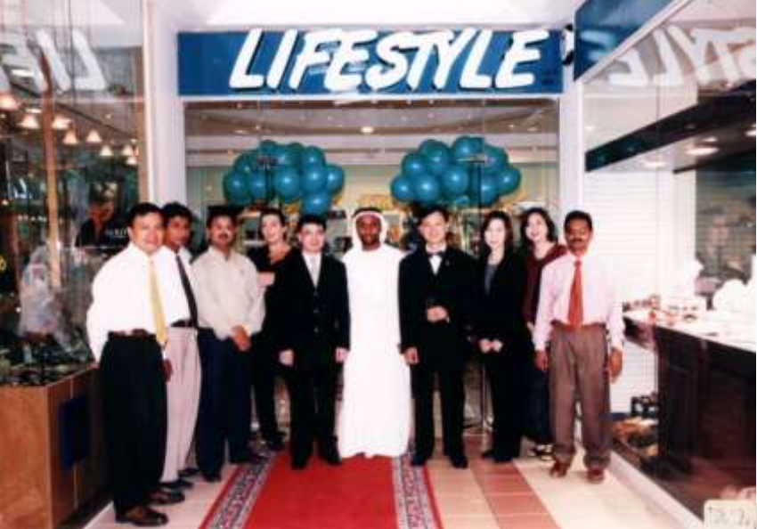
Reopened LIFESTYLE in Dubai in 1997