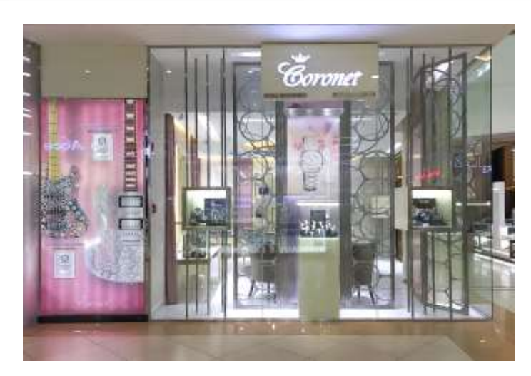
Al Wahda Mall, Abu Dhabi