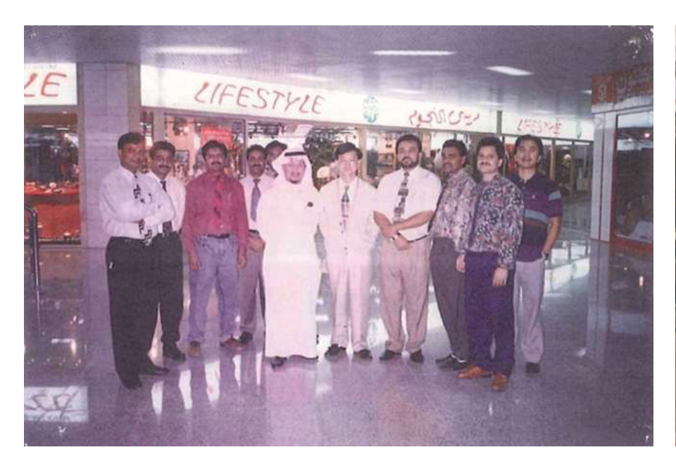
Saudi Arabia in late 80s

To move Arts & Fine Jewelry from Saudi Arabia which started in late 80s to UAE in 1997.