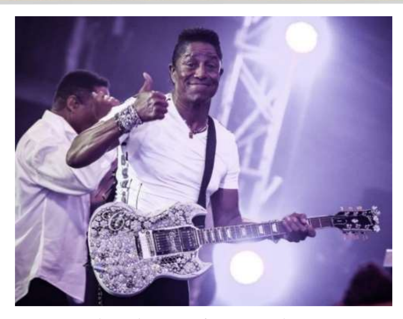
The Jackson's performance with most valuable guitar in Hyde park with 40,000 audiences at BBC prom